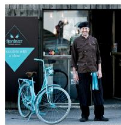
GEIRANGER SJOKOLADE Chocolate with a view

Increase your knowledge about the best thing in the world – chocolate! Try chocolate with flavours like caramelized goat cheese, cloudberry or blue cheese at the award-winning chocolate factory Geiranger Chocolate. Peek through the windows of their production and visit the shop and café. If you have more time and are a devoted chocolate lover, you can join in on a special chocolate tasting CD-60 mlt) and learn about the whole process from tree to mouth. Did you know that they actually have their own cacao trees?