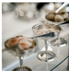
HOTEL UNION Norwegian food traditions

The philosophy at the kitchen of Hotel Union is to make good, traditional Norwegian food from the very best ingredients. As a lunch guest you are offered today's lunch or à la carte – if desired also including a free visit to the vintage car museum.