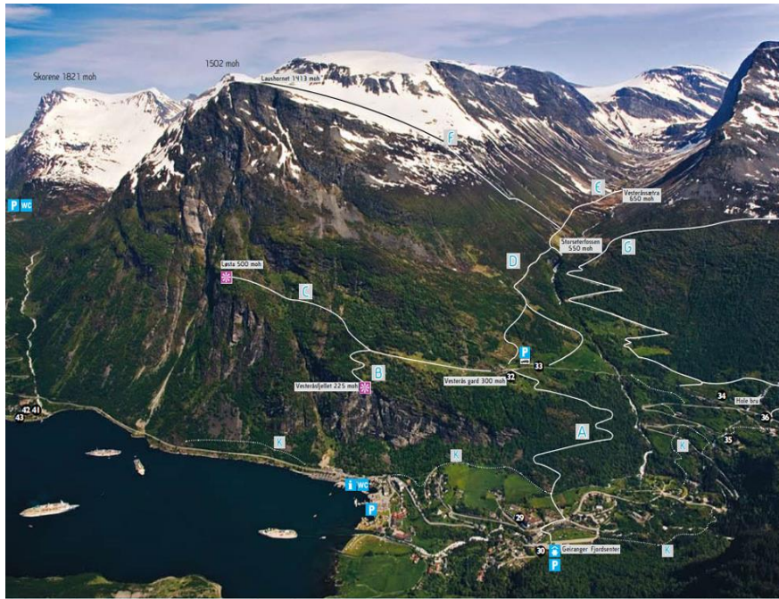
Map showing available hikes