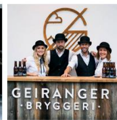
GEIRANGER BRYGGERI An Eldorado for beer lovers

The brewery traditions in the fjords of Norway have always been strong. Mostly, beer was brewed twice a year – a strong beer for Christmas and a lighter for the haymaking season in summer. Want to learn about the beer making, hear the stories and maybe even have a taste? Book a guided trip at Geiranger Bryggeri and finish up with an exclusive beer tasting.