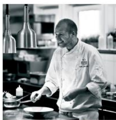
BRASSERIE POSTEN Simple, good and rustic

The idyllic location at the fjord makes Brasserie Posten, Geiranger's former post office, an excellent choice for a delicious meal. The food is made from scratch with the freshest ingredients of the highest quality – simple and good. Choose from a large selection of Norwegian crafted beers, including the beer from Geiranger Brewery.